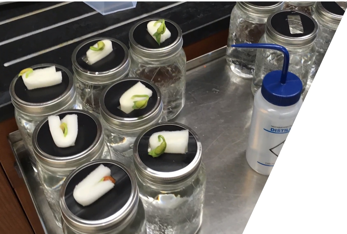
The portable greenhouse uses mason jars as planters